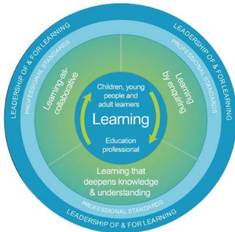
National model of professional learning

In short, to gain professional recognition you must demonstrate how your sustained professional learning has encompassed all aspects of the national model of professional learning.